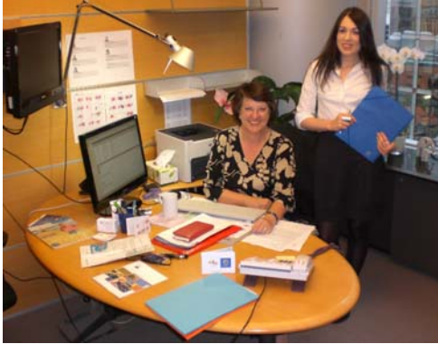
CATHERINE BEARDER (seated) is one of our Liberal Democrat South East MEPs

I was the Vice-President responsible for the Northern Dimension, which includes relations with the Nordic Council, the Baltic Sea Parliamentary Conference and the Parliamentary Conference of the Arctic Region. I have always thought that the EU, with its history of multilateralism, was well placed to bring something to the debate about future governance in the Arctic. Given the rapid changes in the Arctic, it seems to me increasingly important that parliamentarians of these countries have a role. Otherwise there is a trend that debates in this region become ones of national sovereignty and result in bilateral dialogue at best or conflicts at worst.